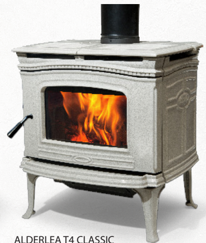
ALDERLEA T4 CLASSIC